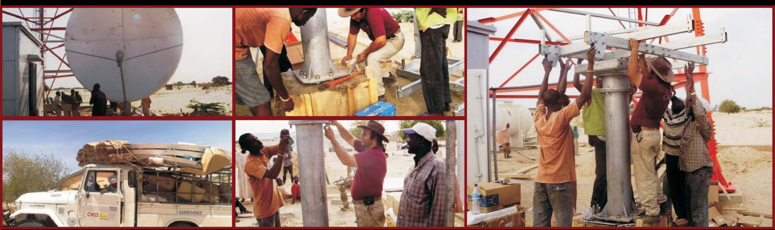
IMPLEMENTATION OF VSAT STATION TO CONNECT MTN CELL SITE AT MALLAM FATORI, BORNO STATE, NORTH EAST NIGERIA