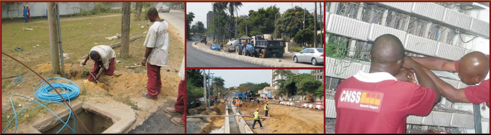
FIBRE & COPPER NETWORK INFRASTRUCTURE REBUILD ON BOURDILLON / ALEXANDRA ROAD, IKOYI, LAGOS.