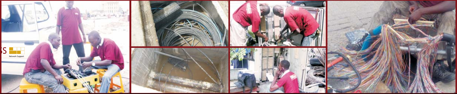
Project B (Fibre Works)